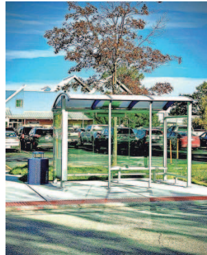
A new bus shelter has been installed along Electric Avenue outside Community Mental Health.